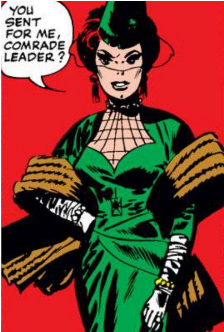
Natasha Alianova Romanova, in her first appearance in Tales of Suspense.