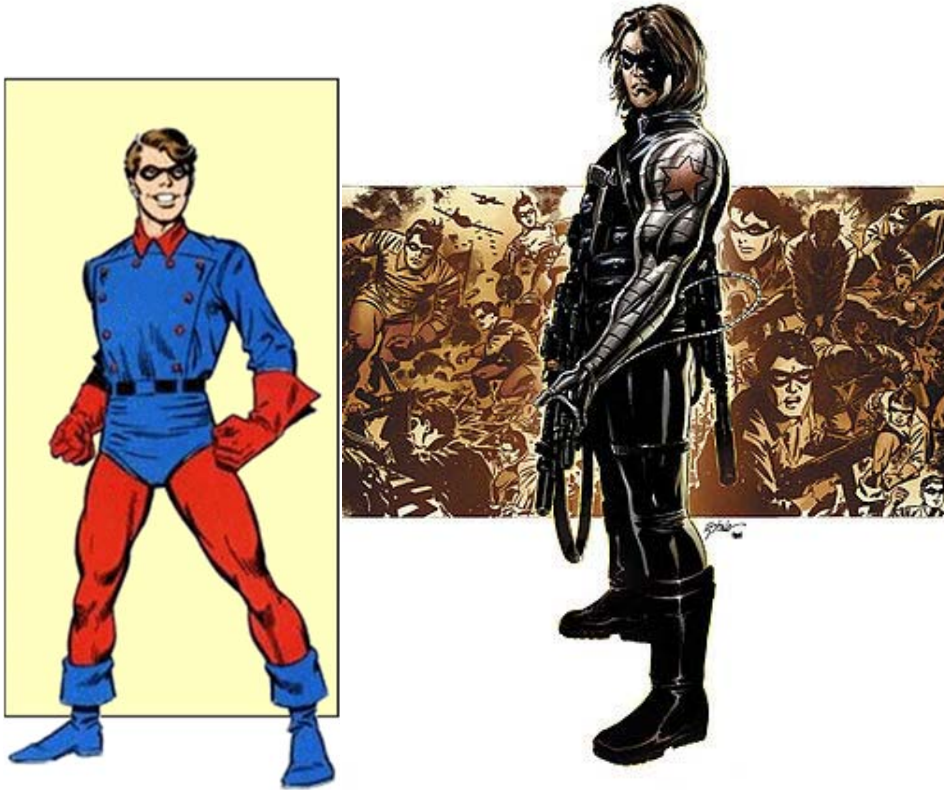
James Buchanan Barnes, also known as Bucky/Winter Soldier, before and after the Red Room treatment.