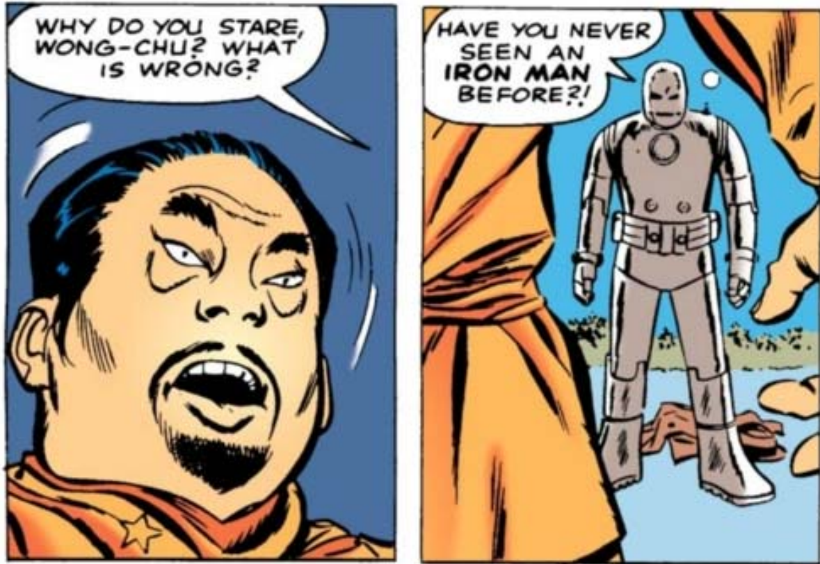
Wong-Chu, a stereotypical Asian overlord, Iron Man's first nemesis.